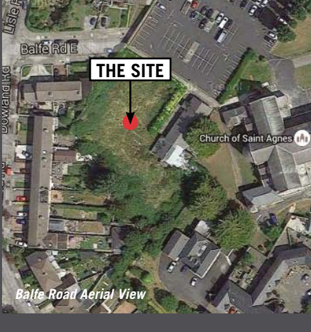
Balfe Road Aerial View