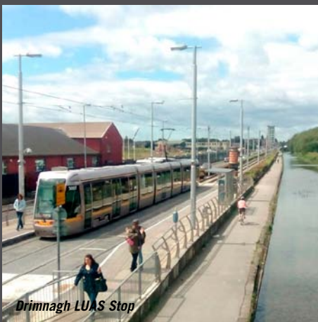
Drimnagh LUAS Stop