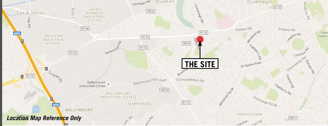
Location Map Reference Only